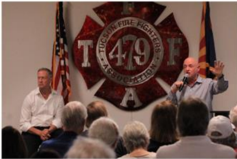
Top left: New Mexico Alliance members with Rep. Melanie Stansbury (NM); Bottom left: Former SSA Commissioner Martin O'Malley and Sen. Mark Kelly (AZ) at the Arizona Alliance's Social Security town hall; Right: Texas Alliance presents a "Retiree Hero" Award to Rep. Mark Veasey (TX)